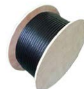
1000' Wood Reel Weight: 48 lbs.