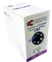
1000' Pull Box Weight: 32 lbs.