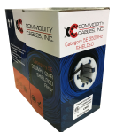
1000' Pull Box Weight: 25 lbs.